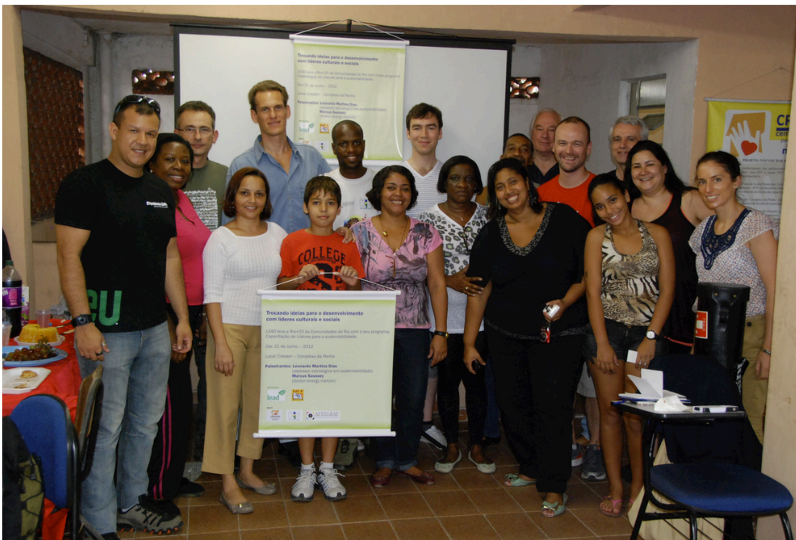
A capacity-building workshop in Rio brought together favela leaders and members of LEAD from four continents.